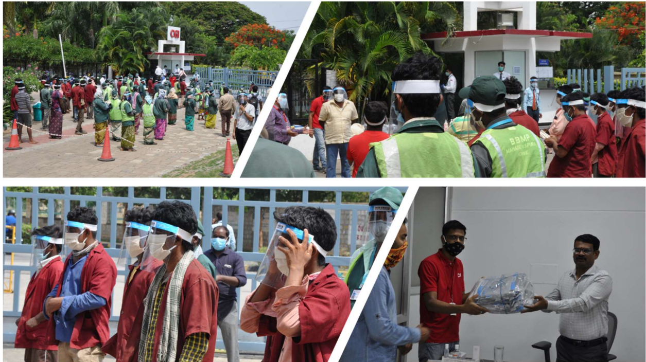
Pour Karmikas have been provided with PPE 21st May in the presence of Corporator , CGI officials and Oasis Foundation representative.

B. Health care worker at different level like Doctors, Nurses, Asha worker, Lab technician and Para Medical are working at high risk and they are in need of Proper protection equipment to carry their day to day work. Following are the different PPE provided for different Hospitals.