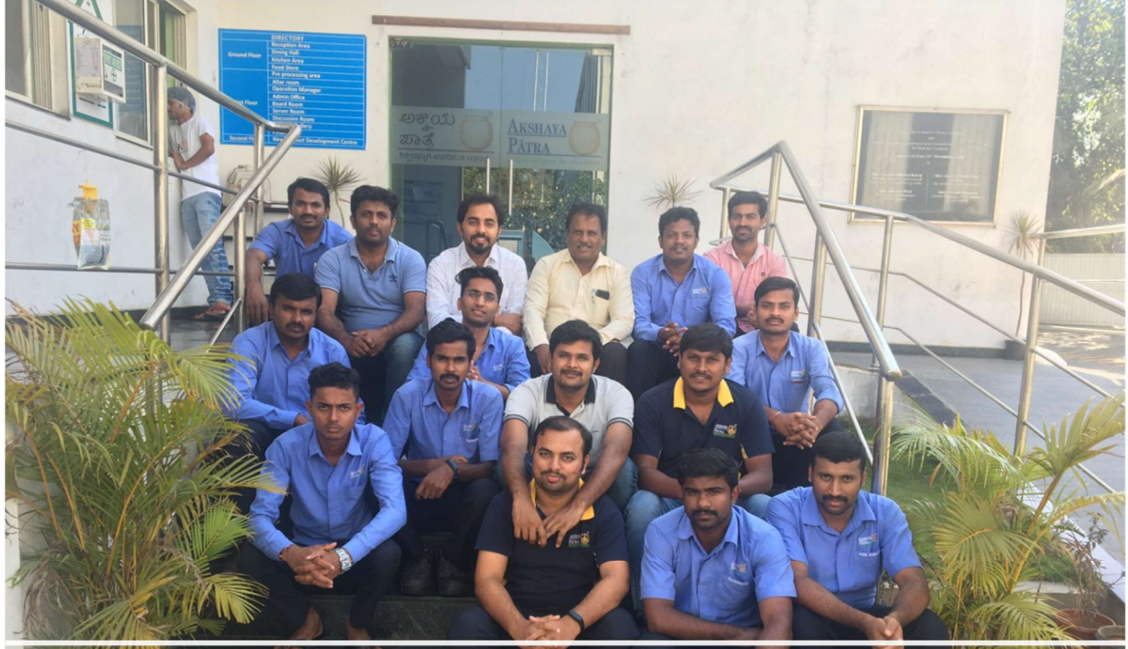
Mock Drill team