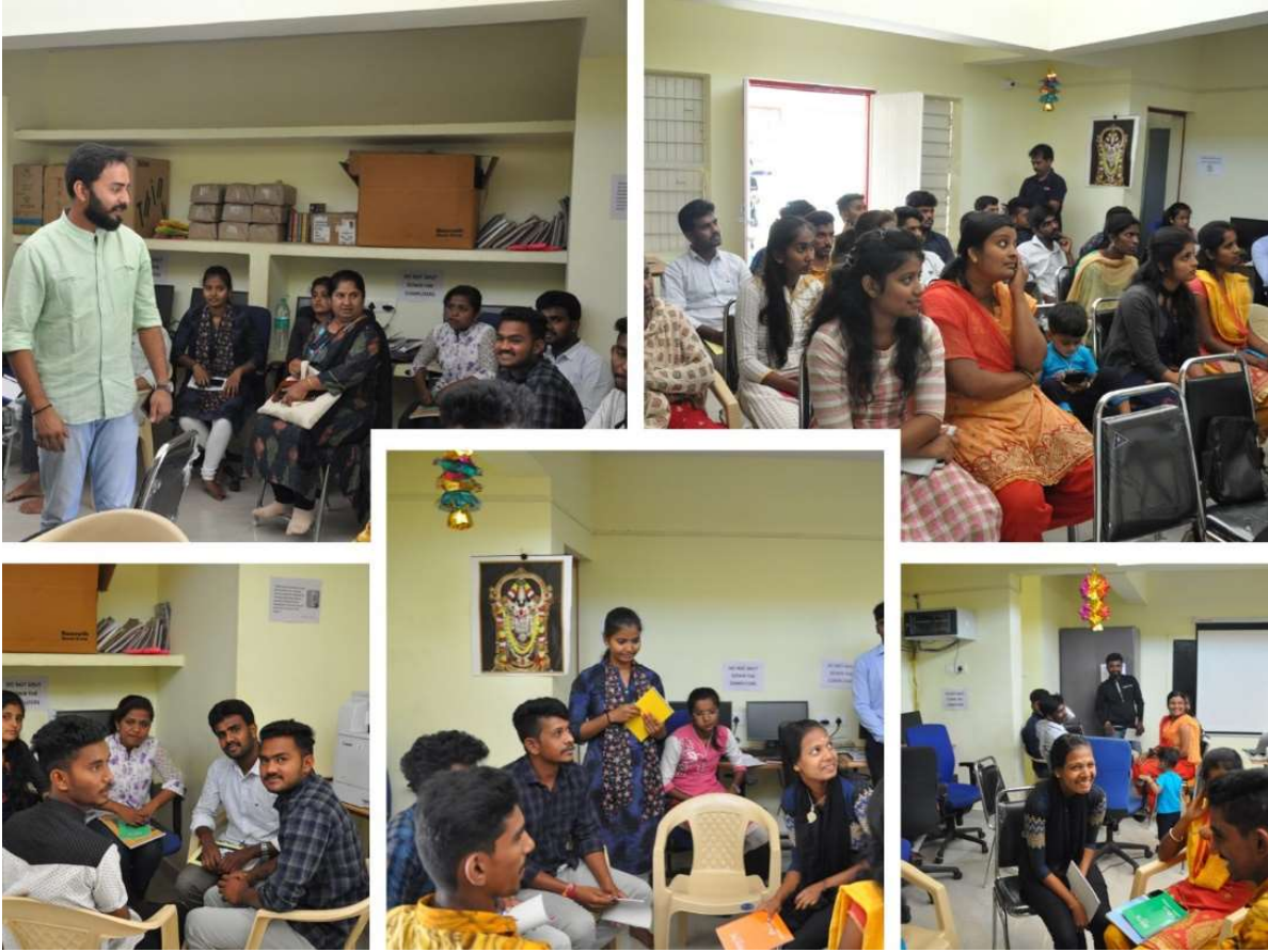
Workshop conducted for selected candidates