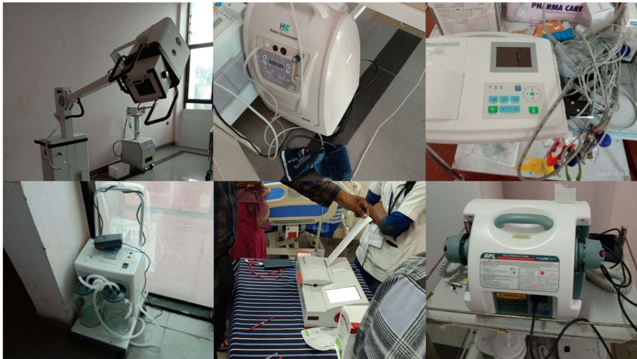
Different medical equipment's installed at the Hospital